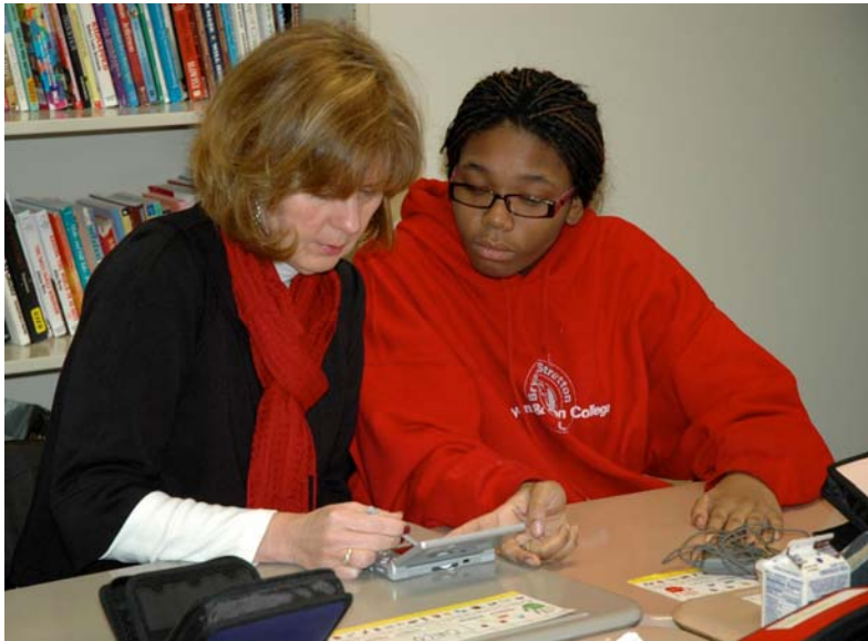
Alternative High School