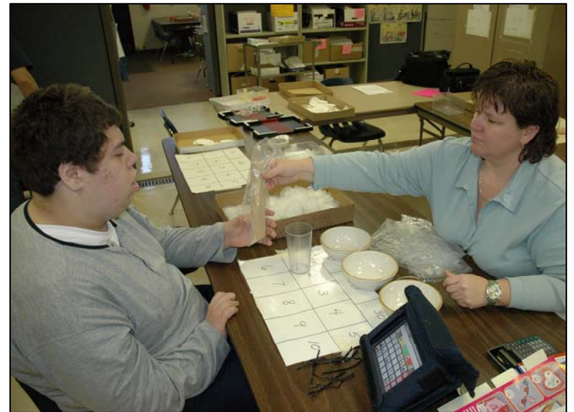
Work Activities Center