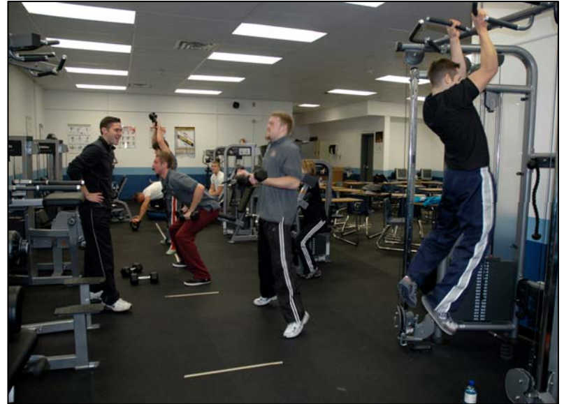
CTE Personal Trainer