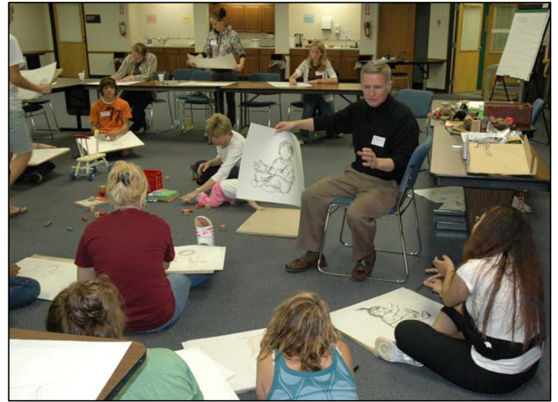
Gifted and Talented