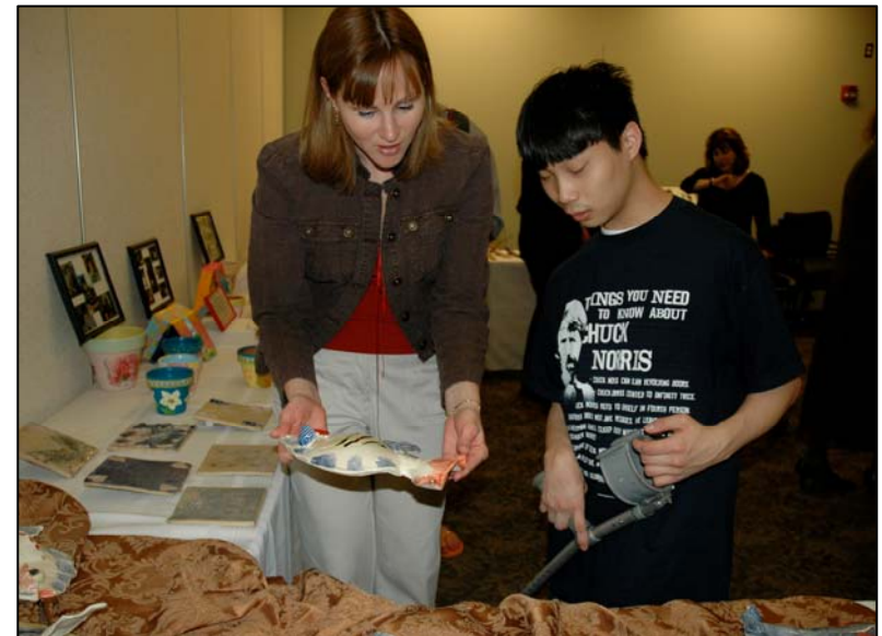
Roberts Wesleyan Transition Program