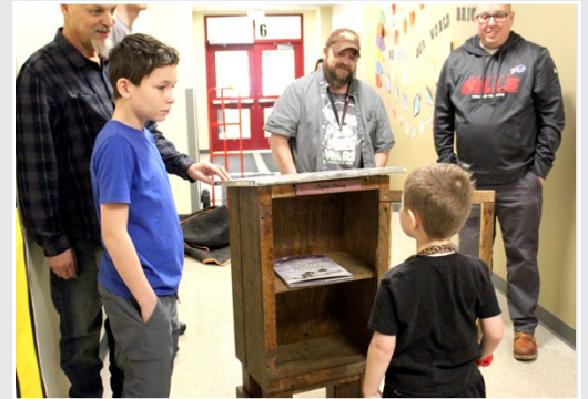
The first of many young readers who will enjoy the new collection adds a book to Leigh's Library.