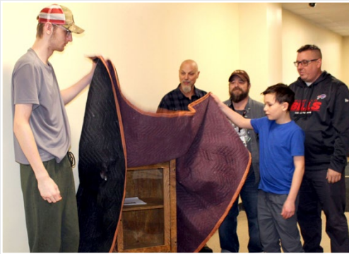
PTP students unveil the new library unit at ECLC.